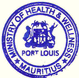
Seal of the Employer